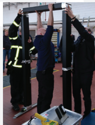
Simple assembly procedure of the Portal-M via plug- or clamp-connections.